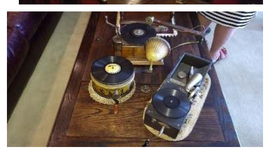
What a collection