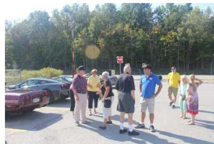
Rest stop on the way