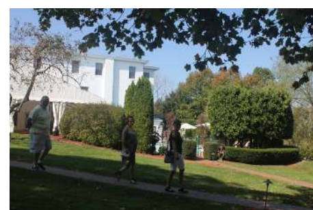
Time to Dine