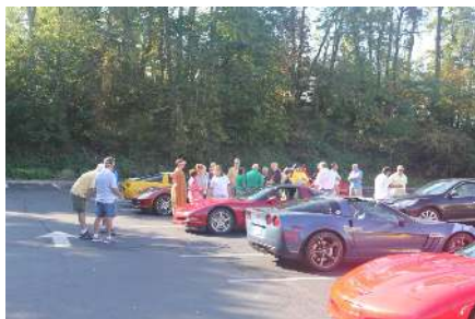
Setting off on our journey