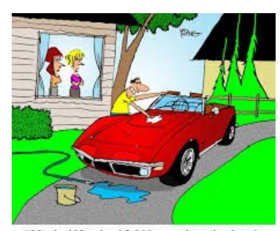
"Maybe if I gained 2,000 pounds and painted myself red, he'd actually spend some time with me."