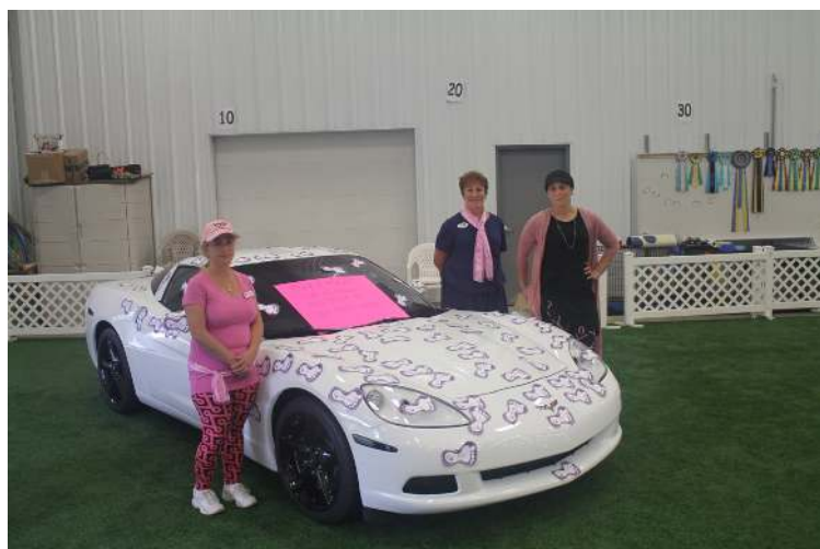
On Your Feet to Fight Cancer Marching to Sue's Car