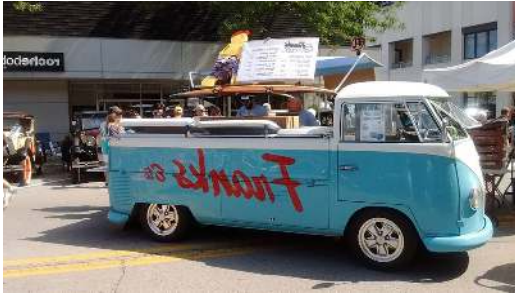
Cruisin on Woodward Avenue