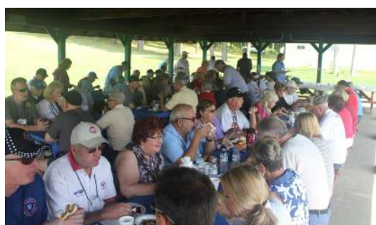
Nice location Good Food Good time had by all