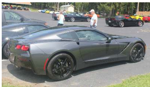
2017 Annual Picnic at Bushy Run Battlefield