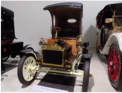
GM Heritage Center