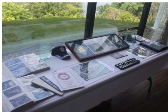
Memorabilia and two of our early members