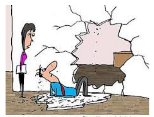
"Let me guess, you finally told him it was you who put the dent in his Corvette last week."