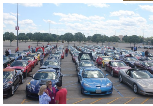
Great time was had by all