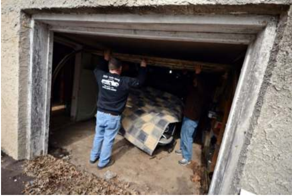
Fuel injected Quad black 1961 Corvette found by Mike Walsh in Pennsylvania