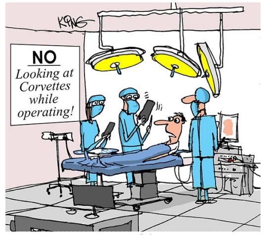
"Am I the only one who can see that sign?"