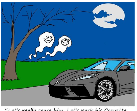
"Let's really scare him. Let's park his Corvette somewhere else so he'll think it's stolen. We'll return it later."

Everything for the Newsletter should be submitted by the 17th of the month.