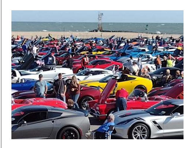
Waiting in the inlet for the parade to begin

The drive was fairly uneventful until we got near Ocean City and hit some serious rainfall that flooded the main road through Ocean City. Thankfully the weather cleared up and Friday and Saturday were sunny and bright. Not everyone participated in the car show or rally but we did all join the Boardwalk parade and had a great time once we got into the inlet and lined up. Saturday evening there was a banquet and then the awards were given out.