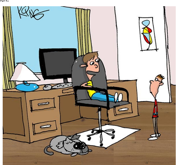
"I hacked into Santa's computer and put a new Corvette on his list of things to get us. It pays to be tech savvy.'

Everything for the Newsletter should be submitted by the 17th of the month.