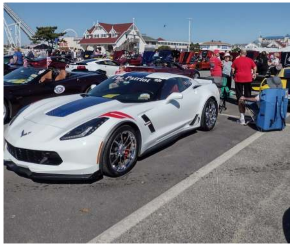
Enjoying the car show