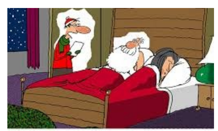
"I wanted to drop by and ask you in person for a Corvette...just in case you didn't get my emails, texts and letters."

Everything for the Newsletter should be submitted by the 17th of the month.