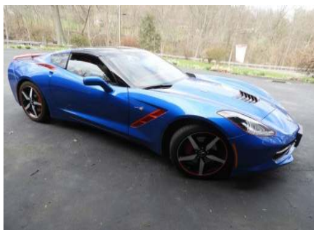
2005 Laguna Blue Corvette Coupe with Red Trim Vin #1G1YC2D79F5116363