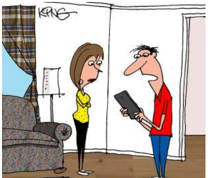
"Our Corvette just texted me. It says it won't drive us anywhere until I give it a bath. I didn't know it was such a clean freak."

Everything for the Newsletter should be submitted by the 17th of the month.