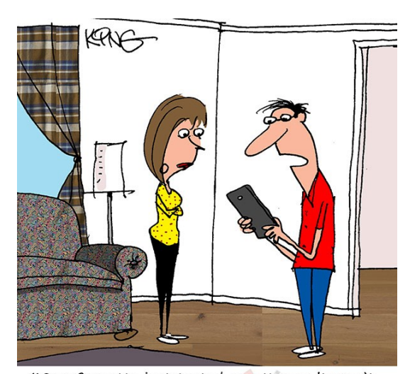
"Our Corvette just texted me. It says it won't drive us anywhere until I give it a bath. I didn't know it was such a clean freak."

Everything for the Newsletter should be submitted by the 17th of the month.