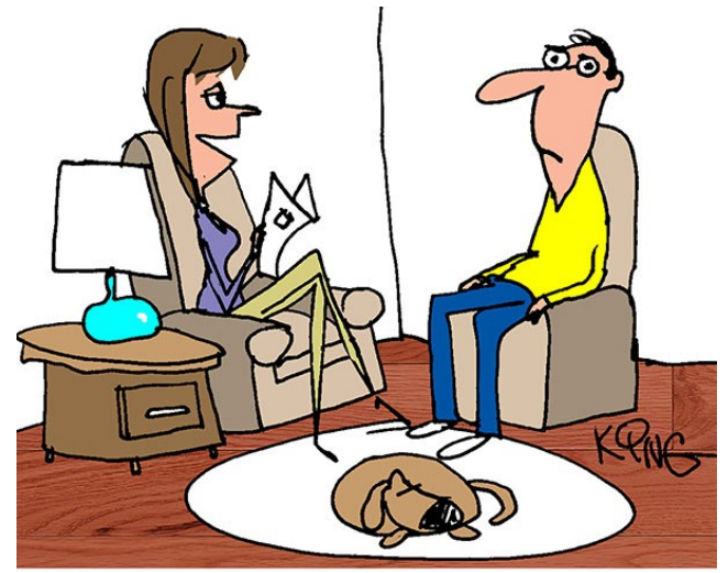
"If you noticed a few extra...thousand miles on your Corvette, it's because I enjoy driving it while you're at work."

Everything for the Newsletter should be submitted by the 17th of the month.